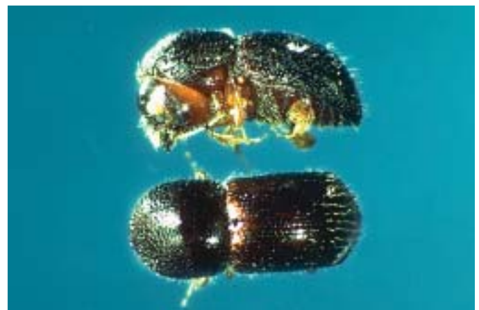
Ambrosia bark beetle adults. (2)