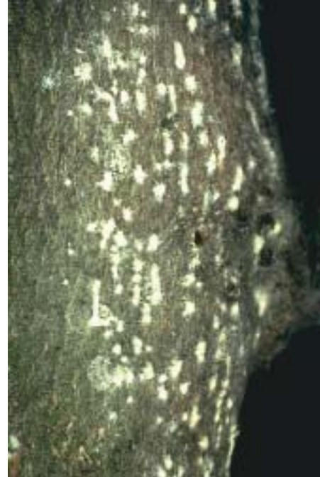
Fusarium and exit hole damage on Styrax (snowbell) caused by ambrosia bark beetle. This beetle killed an acre of Styrax in a nursery by carrying Fusarium into bark tunnels. This is becoming a widespread beetle. (1)