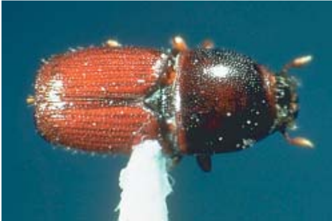
Smaller European elm bark beetle adult. (103)