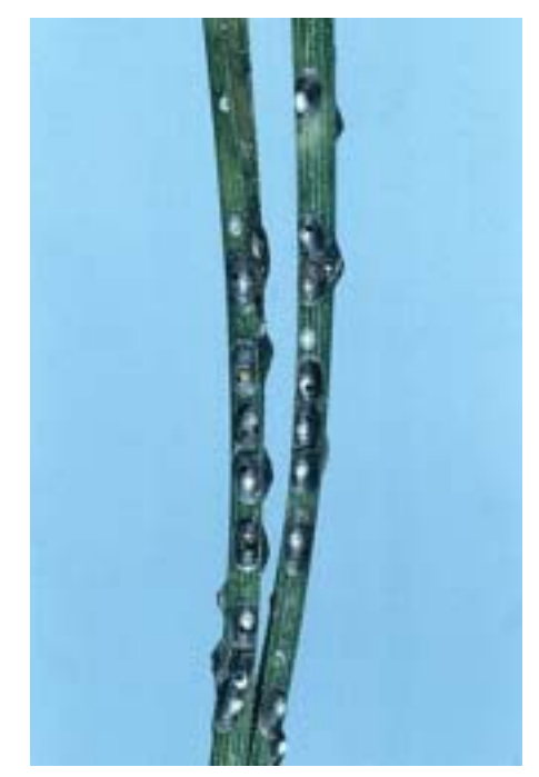
Black pineleaf scale adult females. (19)

Biorational pesticides: horticultural oil, insecticidal soap, pyriproxifen