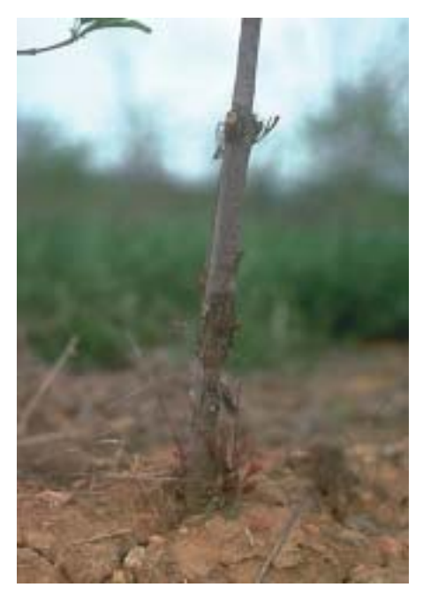
Trunk damage caused by dogwood borer larva. (66)