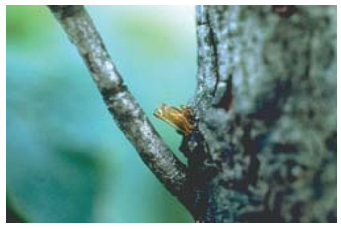
Pupal skin of dogwood borer protruding from trunk. (46)