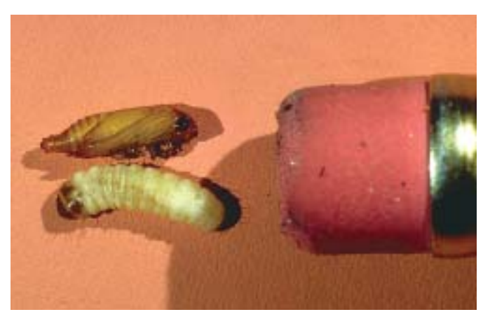
Dogwood borer larva and pupa compared to a standard pencil eraser. (45)