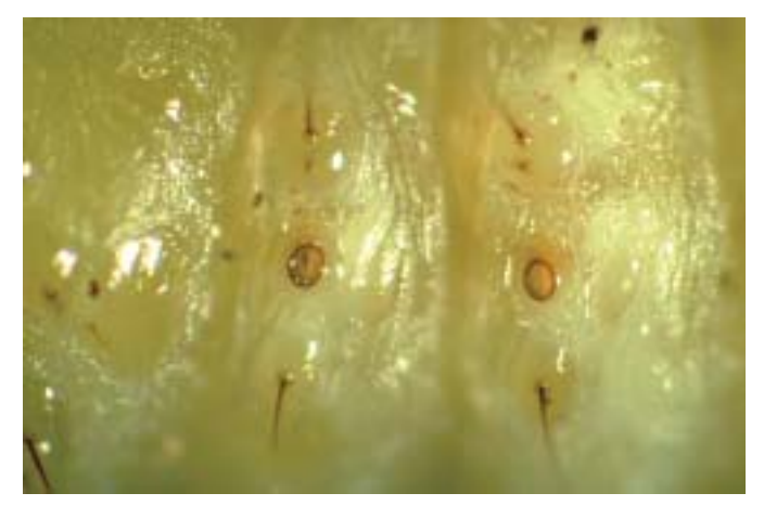
Parasitic nematode, Steinernema carpocapsae , entering peachtree larva through the spiracle (breathing pore). (58)