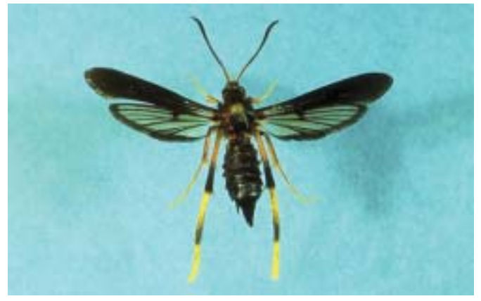
Lilac/ash clearwing borer adult. (20)

Biorational pesticides: Apply entomophagous nematodes ( Heterorhabditis bacteriophora , Steinernema carpocapsae ) with plenty of water, when temperatures are between 55° and 85° F, and when larvae or pupae are present. Many clearwing borers are caterpillars from late June through the winter into April.