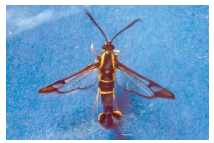
Dogwood borer adult male. (10)