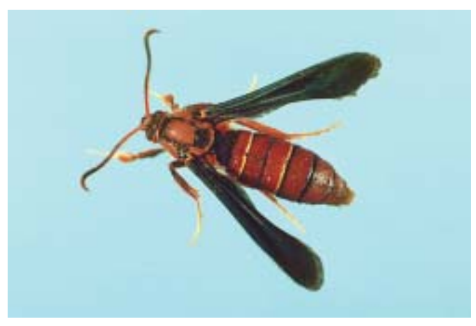
Cottonwood borer adult female. (30)