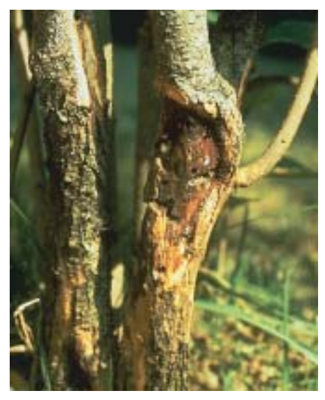
Trunk injury and emergence holes caused by lilac/ash clearwing borer. (47)