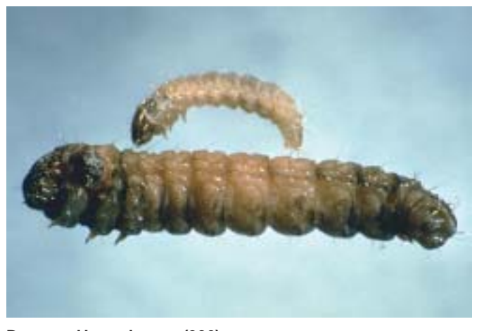
Dogwood borer larvae. (306)