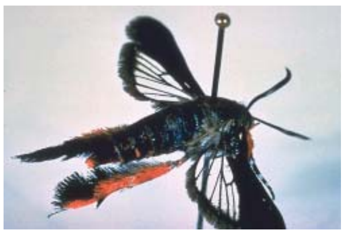
Squash vine borer adult male. (167)