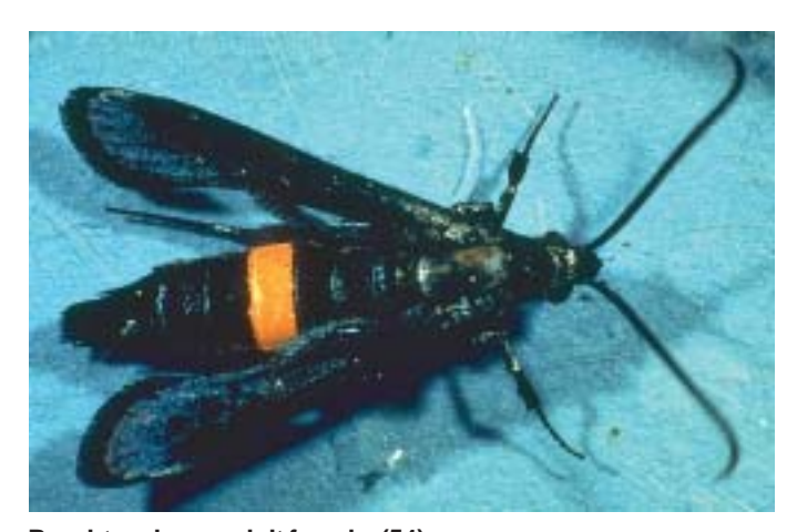
Peachtree borer adult female. (54)