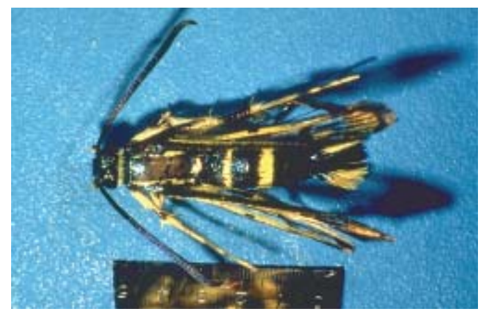
Dogwood borer adult female. (43)