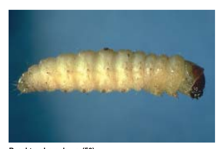
Peachtree borer larva. (56)