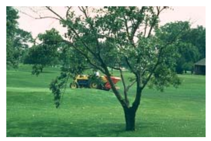
Dieback caused by peachtree borer infestation at base of the tree. (53)