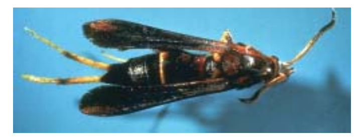
Banded ash clearwing borer adult. (42)