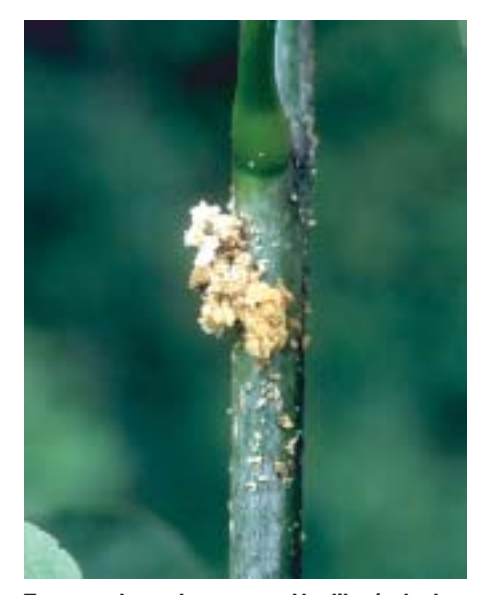
Frass and sawdust caused by lilac/ash clearwing borer larvae. (42)

Monitoring and management for all clearwing borers is similar, since their life cycle is about the same. However, the banded ash clearwing is the exception to the rule; the adults emerge in August rather than May to lay eggs. Look for brown frass around bark cracks and bark wounds. Look under loose bark near wounds or cracks for signs of larval tunneling or empty pupal skins. Display pheromone, or sex attractant, traps in May to capture adult male moths. This trapping information can be used to time pesticide applications. Traps and pheromone lures can be obtained from numerous sources. One source is Great Lakes IPM, at www.greatlakesipm.com. Other suppliers include Gempler's at www.gemplers.com