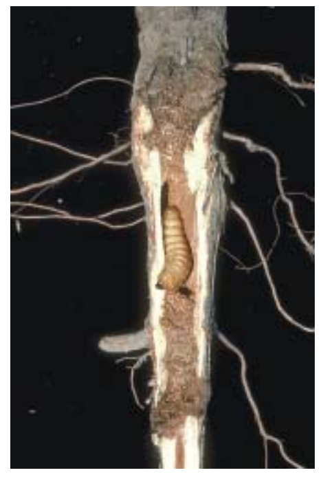
Trunk and root collar damage caused by cottonwood borer. Larva shown in damaged stem. (066)