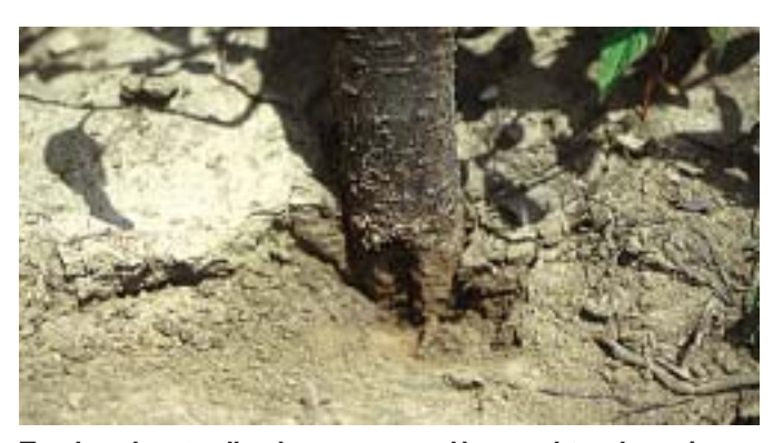
Trunk and root collar damage caused by peachtree borer in a sand cherry in a nursery. (42)