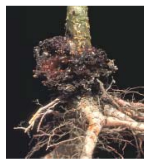
Peachtree borer larvae. Soil removed to show frass and exudate. (39)