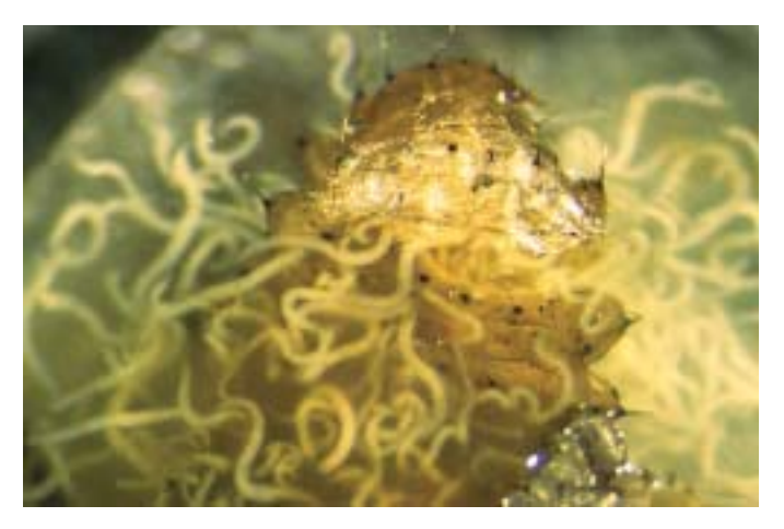
Close-up of nematodes, Steinernena carpocapsae , leaving lysed body of dead pupa. (61)