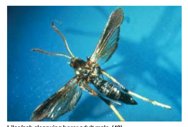
Lilac/ash clearwing borer adult male. (48)