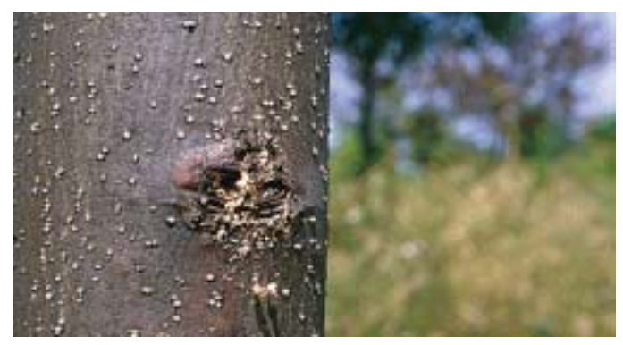
Bark damage caused by banded ash clearwing borer. The borers entered a tree after an adult female laid an egg where a twig was recently pruned. (42)

Conventional pesticides: chlorpyrifos (nursery only), permethrin