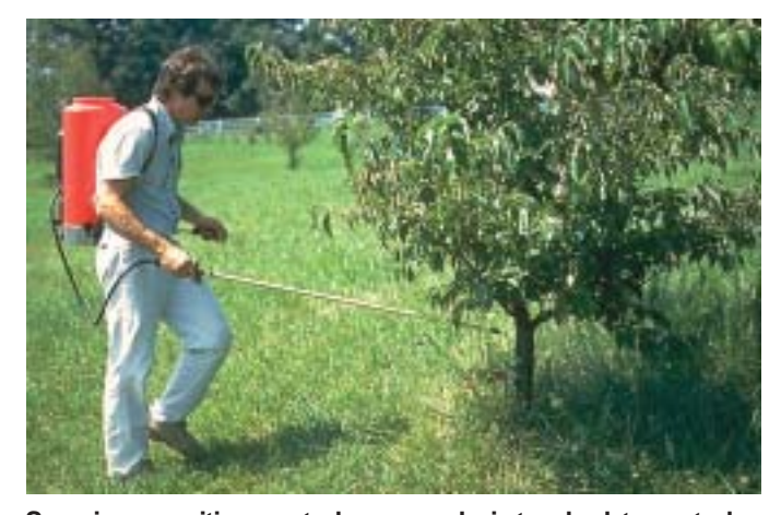
Spraying parasitic nematodes on cracks in tree bark to control clearwing borer larvae. (57)