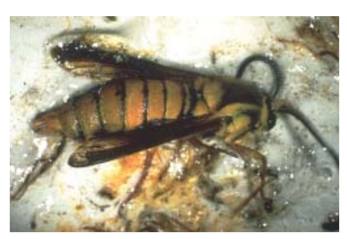
Oak clearwing borer adult male. Males are attracted to pheromone traps. (51)