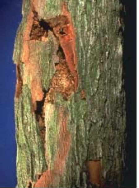
Trunk damage caused by rhododendron borer. (62)