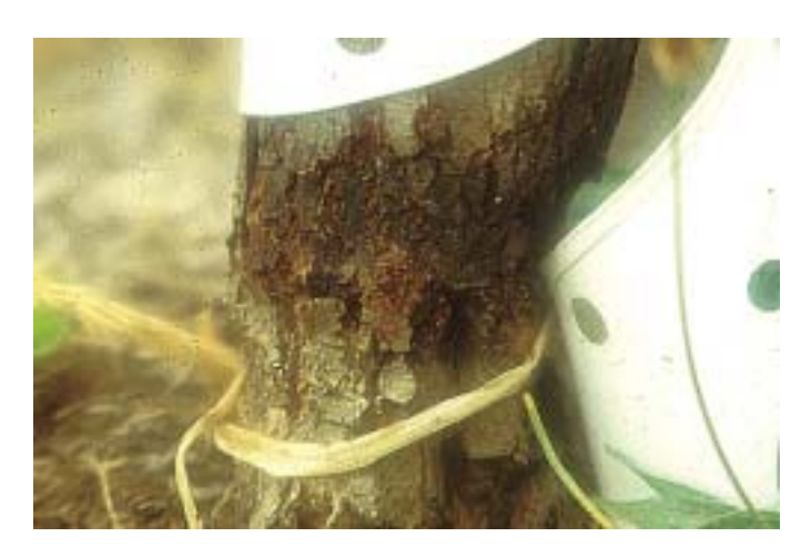
Trunk injury caused by dogwood borer. Wrapping dogwood tightly in plastic barriers keeps wood moist and makes trees more susceptible to injury from dogwood borer. (42)