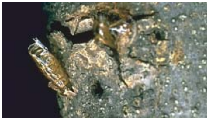
Pupal skin of lilac/ash borer protruding from trunk of lilac. (49)