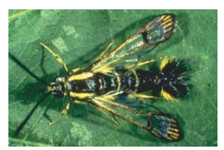
Dogwood borer adult male. (306)