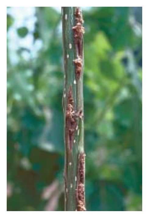
Bark cracks and frass caused by cottonwood borer. (30)