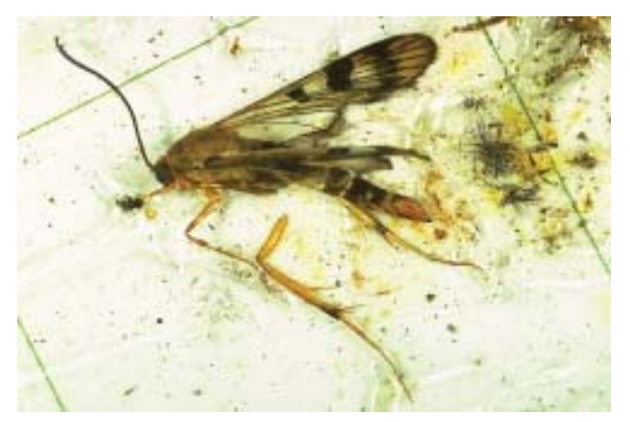
Maple callus borer adult male; note the spotted front wing. Males are attracted to pheromone traps. (50)